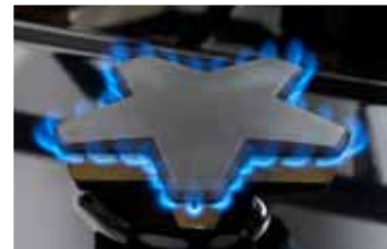
Thermador's Star Burner reinvents the old circular burner to allow even heat distribution.

When it comes to style meeting substance, nothing tops Thermador's Star Burners. This dramatic star-shaped burner allows even flame and heat distribution, and Thermador recently introduced an elevated burner with increased output that fuels performance and allows for quick and easy clean-up.