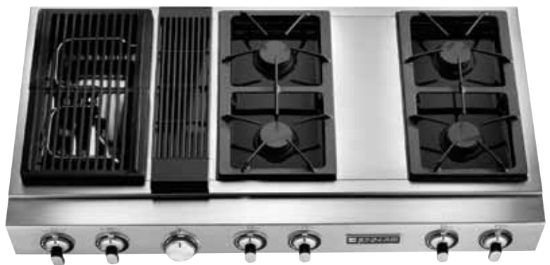
Jenn-Air's modular downdraft cooktop brings the grilling experience inside.

"The future of kitchens is in the integration of elements," says renowned architect and designer Campion Platt. "Virtually all the equipment can be hidden, thus the room can be transformed more to a living than just a function space. More people are opting for eat-in kitchens and also combining kitchen rooms with family rooms. Accordingly, the design of kitchens will become less functional looking and more appealing as an interior room, more connected to the rest of the house."