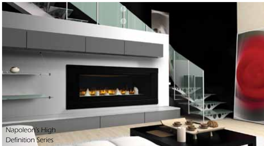
Napoleon’s High Definition Series

Between their “widescreen” look and simple black frames, modern fireplaces have begun to mimic the shape, size and height of flat-screen televisions. Napoleon’s High Definition Series — notable for its unobtrusive “clean face frame” to maximize fire viewing — has actually been mistaken for a flat-panel TV inside Hearth & Stone in