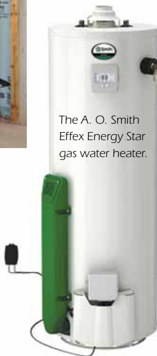
The A. O. Smith Effex Energy Star gas water heater.

Many existing water heaters are vented through the roof to the outside — this is called atmospheric or conventional venting. Replacing an older atmospheric unit with a newer, more efficient unit is typically an easier installation. And now there are reasonably priced, highly-efficient atmospheric water heaters that are ENERGY STAR® rated and have a plug and play feature — like A. O. Smith’s Effex® gas water heater.