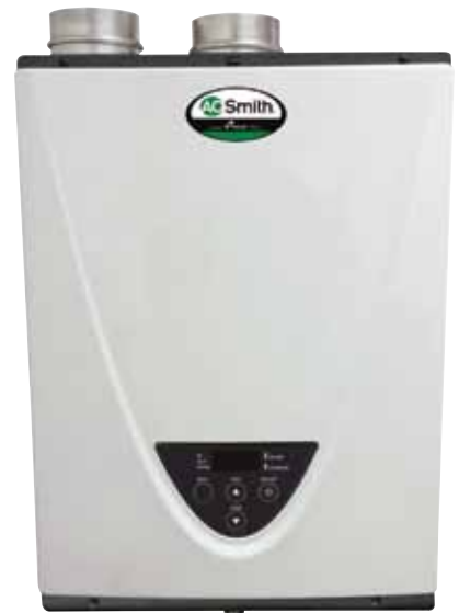
Tankless water heater